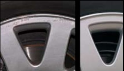
ALLOY WHEEL DAMAGE...GONE