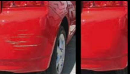
BUMPER BAR DAMAGE...GONE