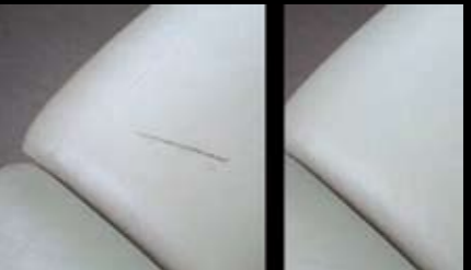
TEARS ON LEATHER SEATS...GONE